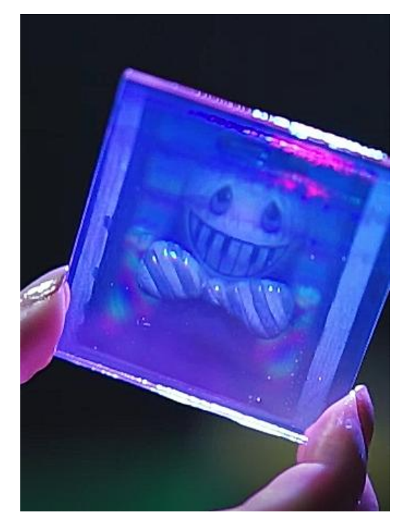
Hologram observed by transmission via halogen spot, after bleach. When the hologram is successful, this image will be very strong.

Then put the bleach back into its bottle, you can reuse it as long as it works.