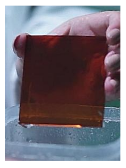
Example of plate after development.