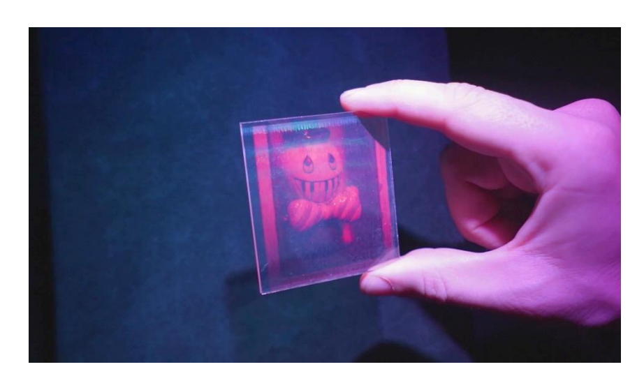
Hologram on Ultimate 08M plate Exposed with He-Ne Laser - Reconstructed in white light (halogen)