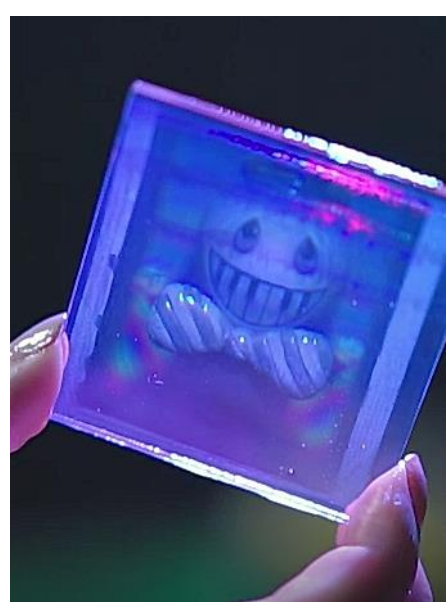
Denisyuk Hologram observed by transmission via halogen spot, after bleach but before drying.

For maximum transparency, if you need it, bleach again for 30 seconds more. Then rinse again.