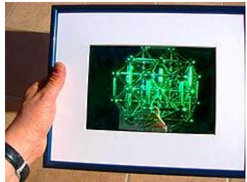
Ultimate 08, laser 532nm, hologram Denisyuk