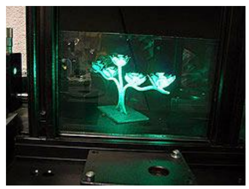
Ultimate 08, laser 532nm, transmission hologram H1

Do not hesitate to share your results and observations with us!