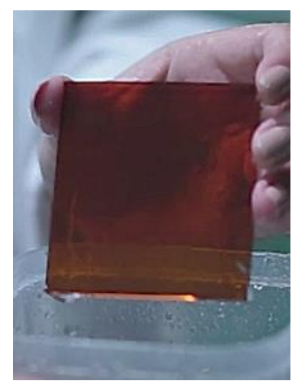
Example of Ultimate 08M plate after development. Exposure: 100 μJ/cm² with a He-Ne Laser

After development, the Ultimate 08M plates will have a pale red/orange color.